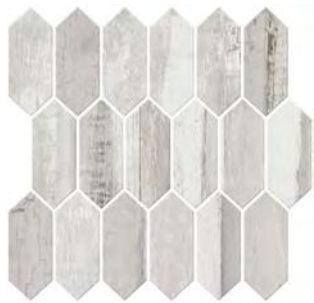
ROMANTIC WHITE CM40