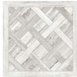
ROMANTIC WHITE GENRE CM44