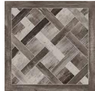
DRAMA GENRE CM47