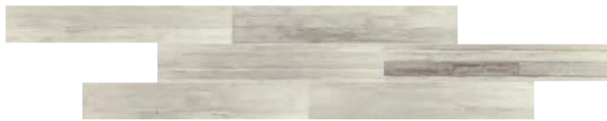
ROMANTIC WHITE CM40