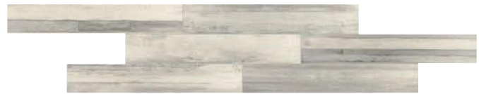
CLASSIC GREY CM41