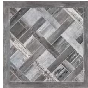
DOCUMENTARY GENRE CM46