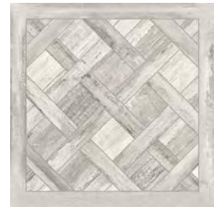
CLASSIC GREY GENRE CM45