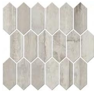
CLASSIC GREY CM41