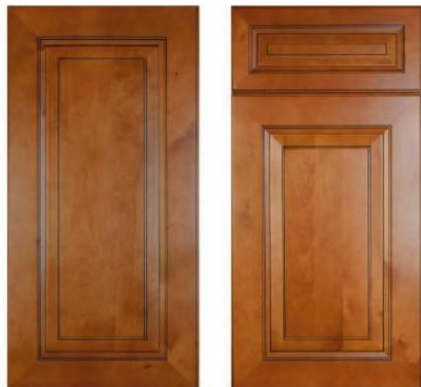
Newport Model: NT