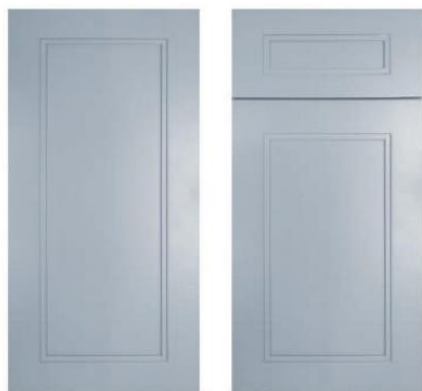
Sterling Model: SG