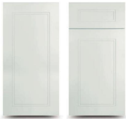
Soda Model: SO