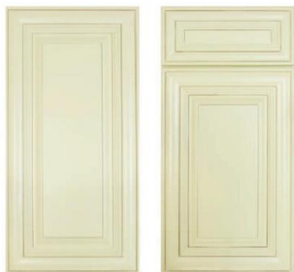
Perla Model: PE