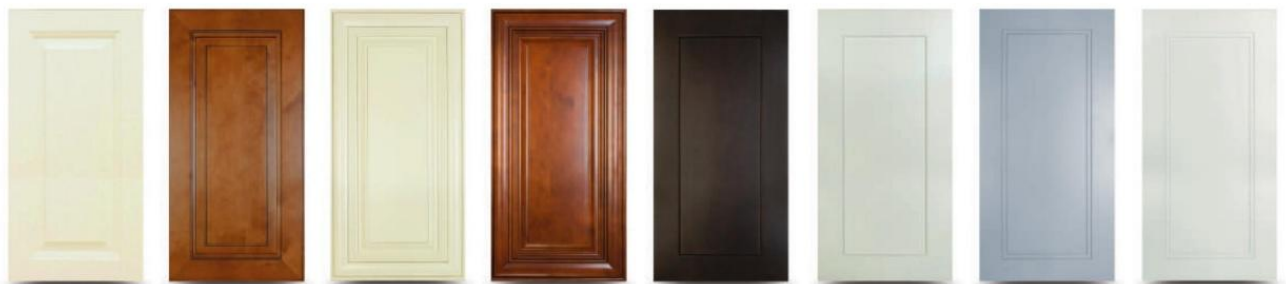
Avalon-AL Newport-NT Perla-PE Charlton-CT Ebony-ES Dove White-DS Sterling-SG Soda-SO