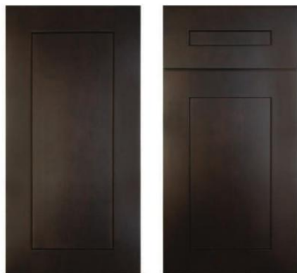
Ebony Shaker Model: ES