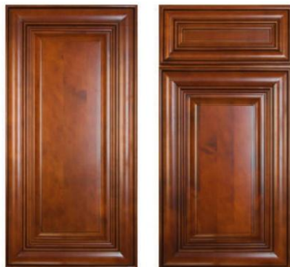
Charlton Model: CT