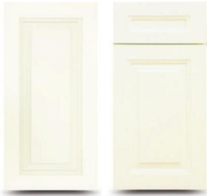
Avalon Model: AL