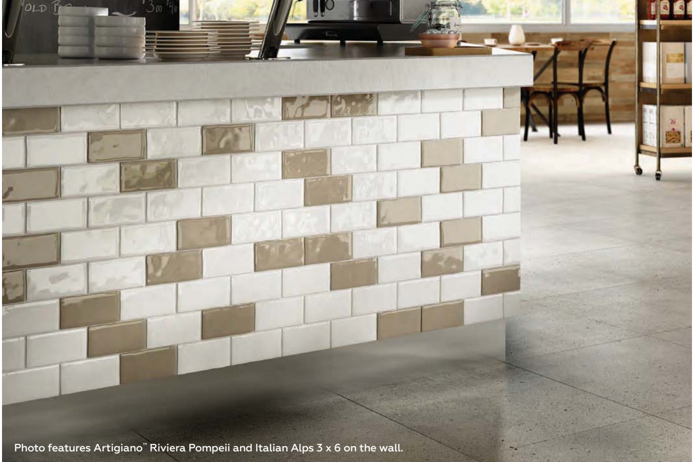
Photo features Artigiano™ Riviera Pompeii and Italian Alps 3 x 6 on the wall.