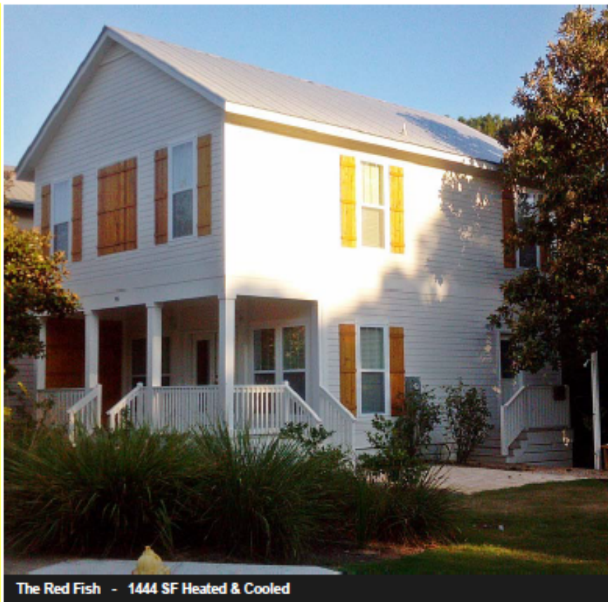
The Red Fish - 1444 SF Heated & Cooled