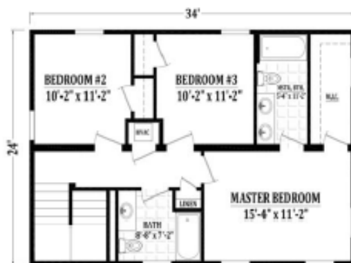
RED FISH (2nd LEVEL)

1444 SQ FT HEATED/COOLED 1632 SQ FT UNDER ROOF